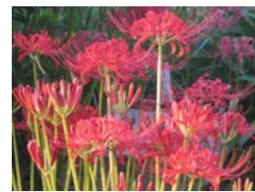
Red spider lily (Lycoris radiata)

Moreover, as you walk, you can take in the exquisite beauty of a Japanese garden and a 250 year old bayberry tree alongside the walk.