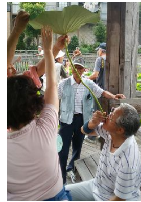
Sake served through an “elephant trunk”

<3>Pour sake into a lotus floor leaf, and taste the sake as it trickles down through its stem, the “elephant trunk”. It tastes good with the added lotus flavor. When this way of drinking sake was first tried, it soon became popular.