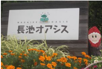
Entrance to Nagaike Oasis