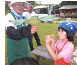
In the same manner, children drink water