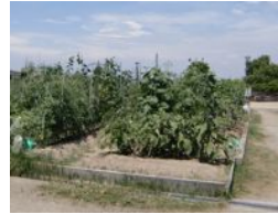
Rental farm plots