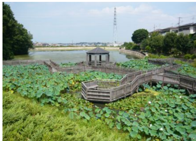
The Boardwalk in the Aquatic Plant Field