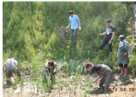
Cleaning the aquatic plant area

Twice a year, the members of the residents' committees in the neighborhood get together to do the cleaning and mowing.