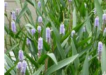
Pickerelweed ( Pontederia cordata )