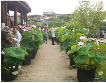
Views of the Lotus Flower Festival