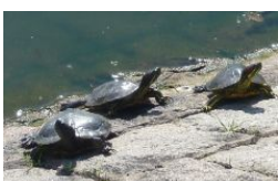
Red-eared slider turtle ( Trachemys scripta elegans )