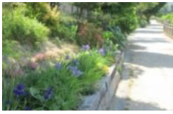
Flower garden along the walk