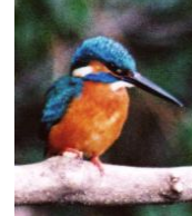
Kingfisher( Halcyon )

<*1> Osaka Prefecture regards the whole of its area as a single museum and tries to promote its charms.