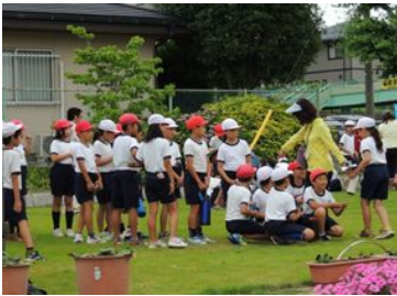
Field activities of the elementary school pupils

July (Lotus Flower Festival): Lotus flowers are at their best in July. Visitors can taste lotus tea, lotus nut Zenzai (sweet lotus nut soup with pieces of rice cake), and sake “served through an elephant trunk”. <3>