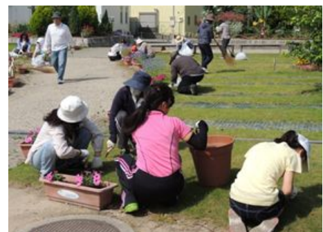
Maintaining the flower garden