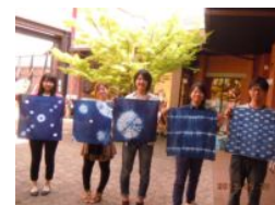
Things Dyed Blue with Indigo