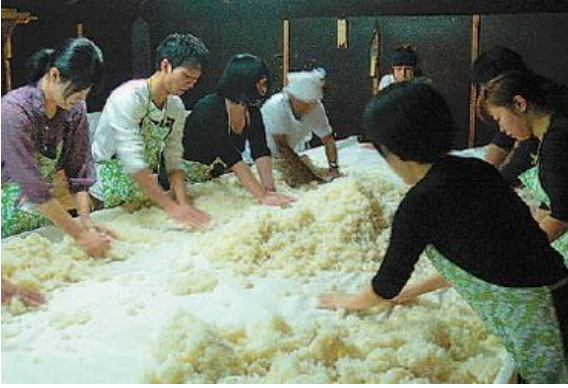
“Koji” (a sort of yeast) making is indispensable for rice fermentation